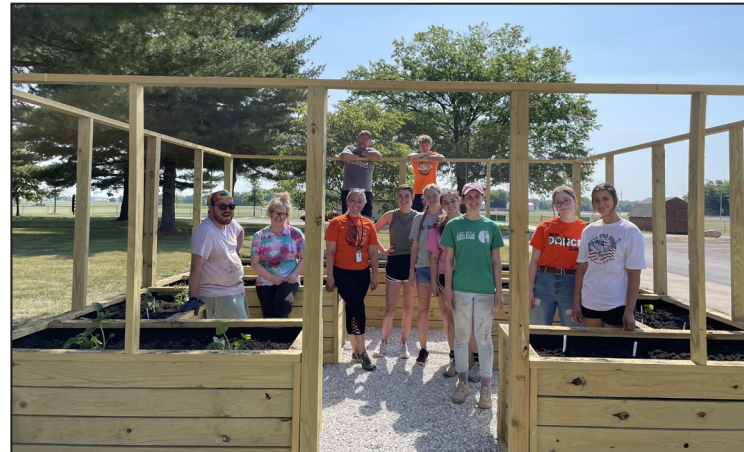
Interact Club members in finished garden.