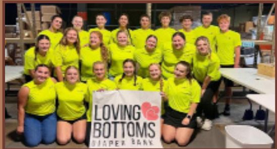
Interact club at Loving Bottoms