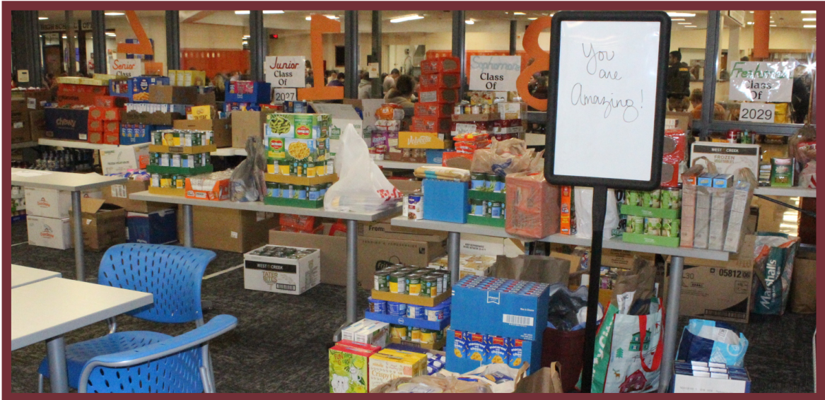
Canned goods sit in the IBHS library awaiting counting.