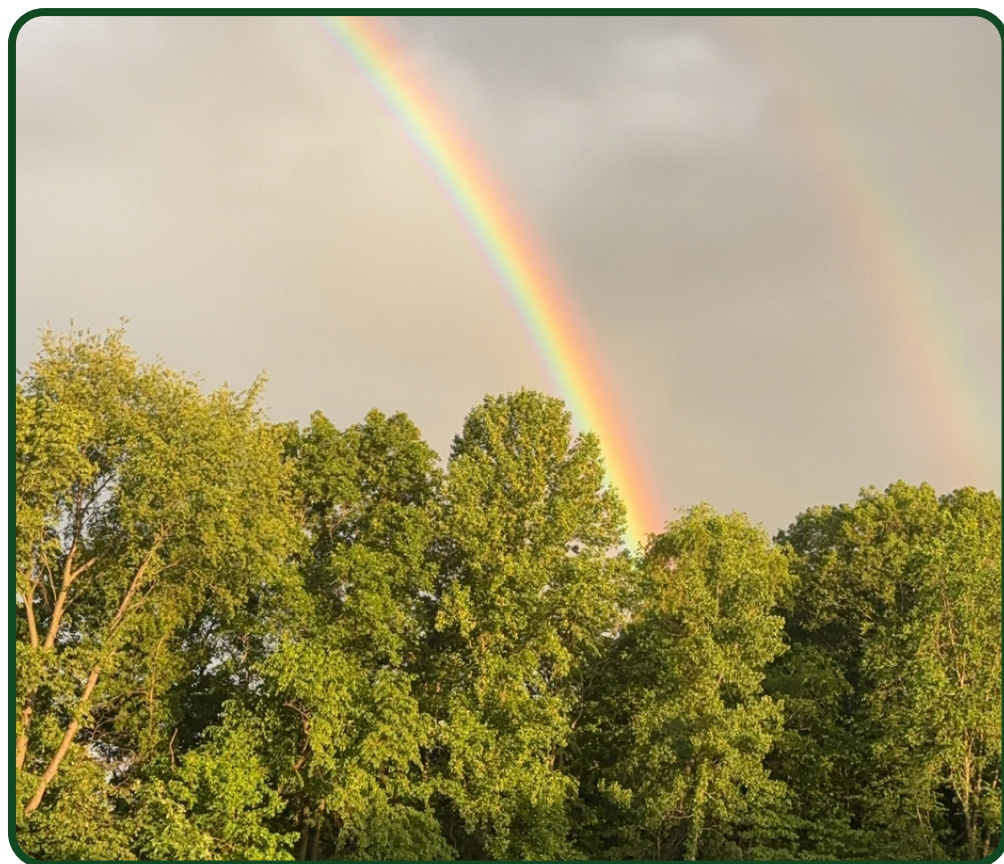
Double rainbows

The people of the race buried their dead with their valuables; the invaders had believed it was gold,